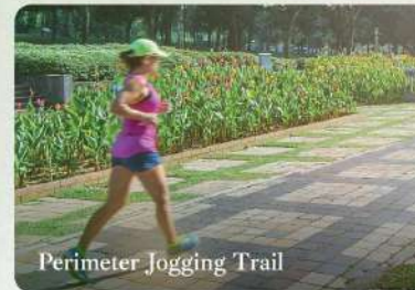
Perimeter Jogging Trail

Choose your creature comforts in the privacy and safety of your guarded community home