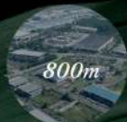
Kulim Hi-Tech Park