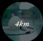
Kulim Hi-Tech Sport Complex