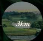
Kulim Golf & Resort