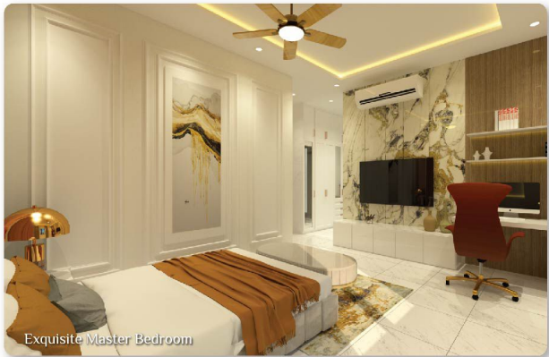
Exquisite Master Bedroom