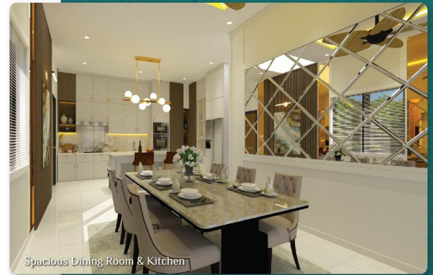
Spacious Dining Room & Kitchen