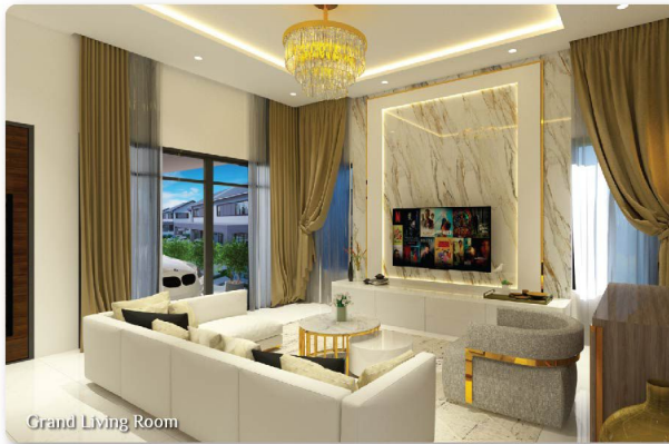
Grand Living Room