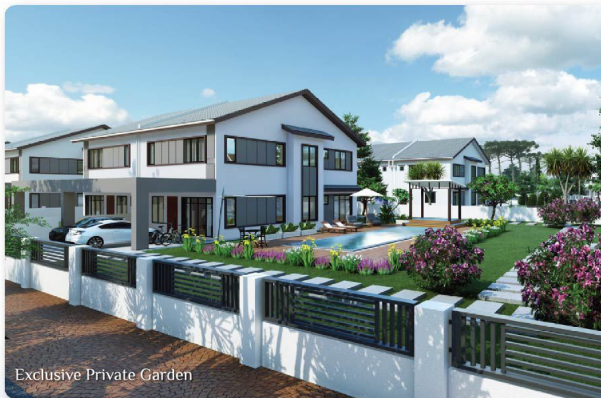
Exclusive Private Garden