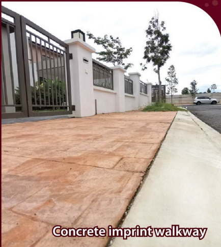
Concrete imprint walkway