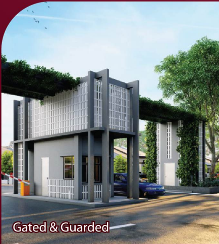
Gated & Guarded