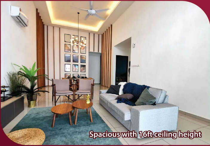
Spacious with 16ft ceiling height

Saujana Permai brings you a contemporary home, designed for practical and elegant living. Clean modern lines, high ceiling, glossy floor tiles and wide glass window come together to create a stylish home that takes your lifestyle a step higher. Guarded and gated, with personalised home alarm system, a Saujana Permai cluster house offers you the comfort of added security in an ideal place for your family to call home.