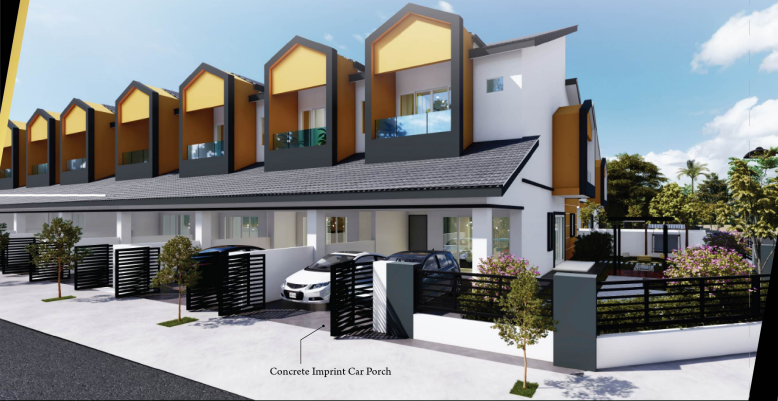
Concrete Imprint Car Porch

Embrace serenity and comfort with our greater open layout concept, high ceiling and the prominent glass railing on the balcony